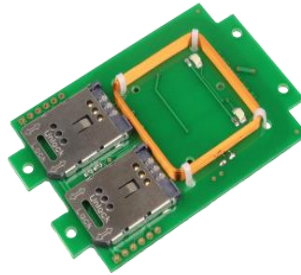
TWN4 OEM PCB Top View